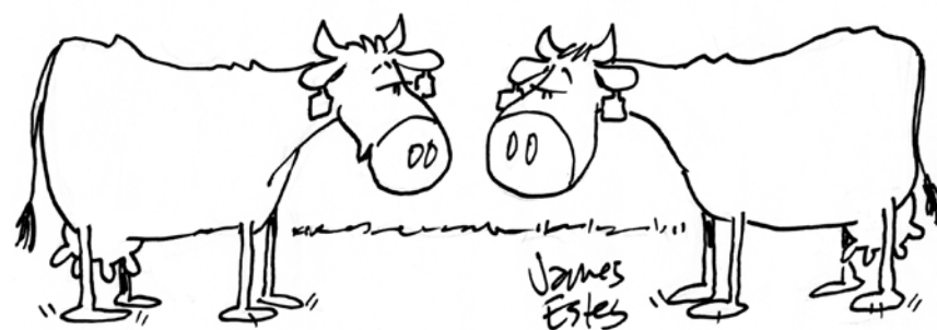
"I don't mind the ear tags — I would pick a different color, though."

3. The U.S. All-Milk price in the last three years was substantially higher than the world market price. U.S. dairy farmers benefited from a higher and more stable milk price than farmers in the EU or Oceania. On the other hand, U.S. dairy exports have dropped and dairy imports (in milk equivalents) have climbed. 🐄